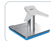
Magnetic Dock Stand 1