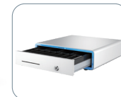
Cashier Box 1