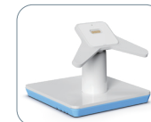
Magnetic Dock Stand 2